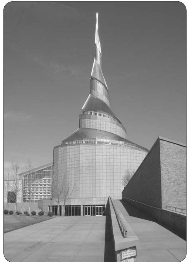
Community of Christ Temple Independence