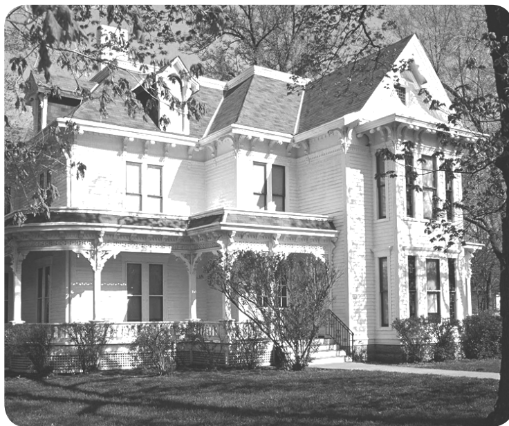
Harry S. Truman Home, Independence, Missouri