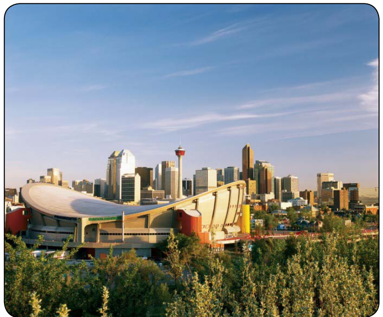
Saddleback Dome, Calgary

Canada is a richly diverse and cosmopolitan nation and as such beckons the immigration of new viewpoints on Mormon history. International studies of the Mormon experience and comparative studies with other faiths and their environments should prove stimulating. Some of the many topics we envision are how have media and the new era of electronic digitization influenced the print culture of Mormon history and historical research? What influence has