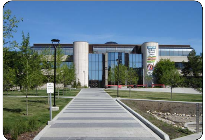
MacEwan Conference and Event Centre

Of course, convenient access to good food for conference attendees is a must. Besides the lunches and banquets that are part of the conference and the Hotel Alma's Bistro, attached to the Hotel Alma on the university campus is the university Dining Centre, providing breakfast and lunch at modest prices for those attending the conference. A food court is also available in the MacEwan Student Centre, part of the MacEwan Conference and Event Centre. A number of other eating establishments are located just off campus.