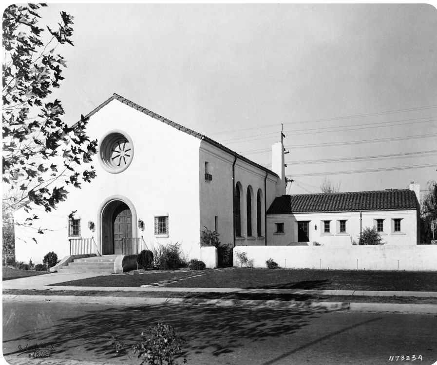
Sacramento Third Ward Building

With just a few weeks to go before the upcoming Sacramento MHA meeting we encourage you to register now for the May 22 – 25 conference. The theme for this year's conference is "Growth and Gateways: Mormonism in a Wider World" and the Sacramento meeting will provide us with a unique opportunity to consider Mormon history in the broader context of the settlement of the American West. California has, over the course of the 19th and 20th centuries, also served as an important "gateway" for the growth and expansion of the Restoration movement and we look forward to exploring the unique role of the "Golden State" as an access point to Asia and the Pacific. With 36 concurrent sessions and over 100 conference papers, an outstanding list of speakers, and a series of exciting and interesting local tours, the Sacramento MHA conference will be a wonderful opportunity to meet and discuss LDS Church and Restoration history.