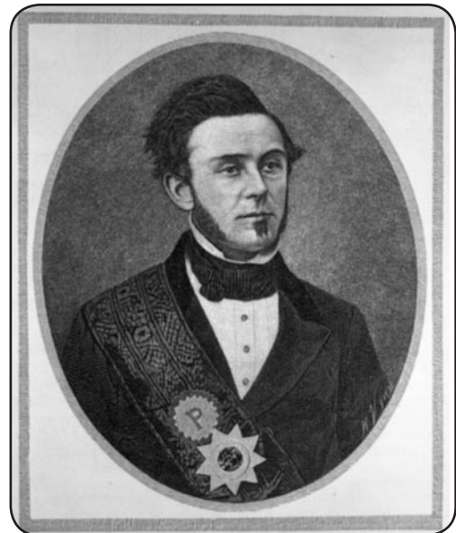
Samuel Brannan