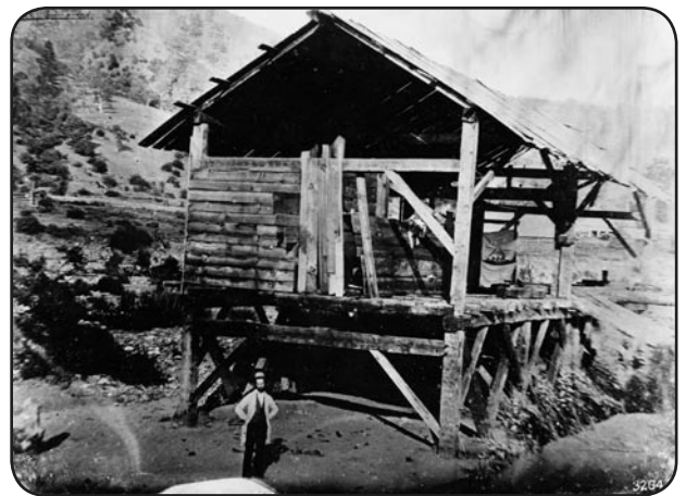
Possibly James Marshall, discoverer of gold standing in front of Sutter’s Mill along the American River in Coloma, California, ca. 1850

Please plan to register early and come and enjoy the great relaxed atmosphere of an MHA conference.